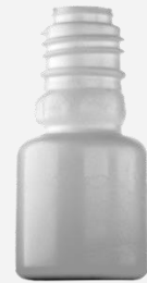
Ratchet not formed