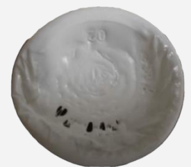
Contamination on the base